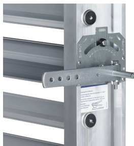
QUADRANT STAY FOR JZ- AL AND JZ-HL-AL

The quadrant stay is situated between the first two blades from the top