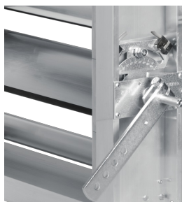
QUADRANT STAY WITH

The quadrant stay is situated on the first blade from the top (dampers with up to three blades) or on the third blade from the top (dampers with at least four blades)