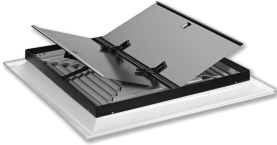
WITH BUTTERFLY DAMPER