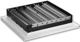
WITH DAMPER BLADE