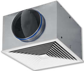
WITH PLENUM BOX