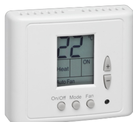
ROOM TEMPERATURE CONTROLLER ETN-24- VAV-227-P

Room temperature controller type ALT24/SUPER