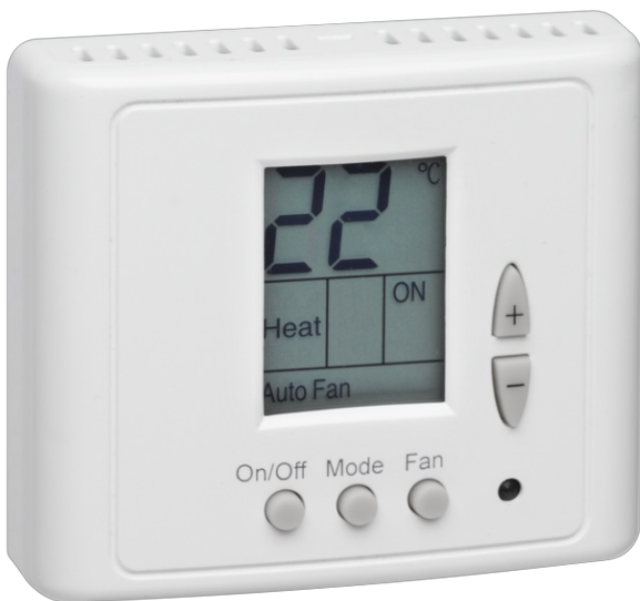
Remote control for room temperature controller ETN-24-VAV-227-P