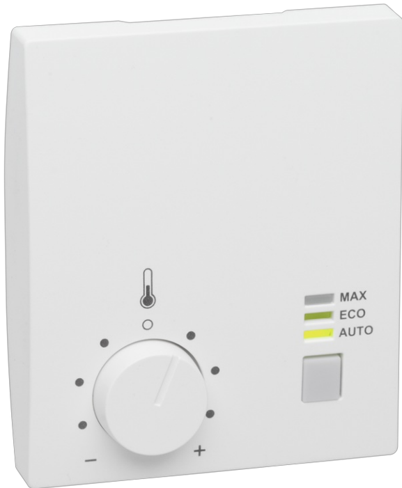
Room temperature controller ETN-24-VAV-227-P