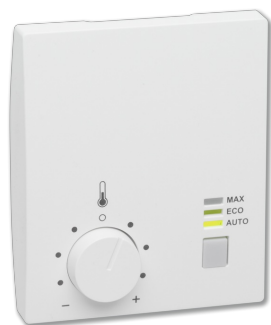
ROOM TEMPERATURE CONTROLLER TYPE CR24-B1