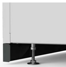
Levelling foot and plinth