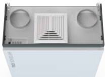
Outdoor air and exhaust air connections