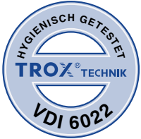
Conforms to VDI 6022