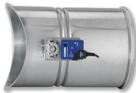
CONNECTION TO CIRCULAR DUCTS