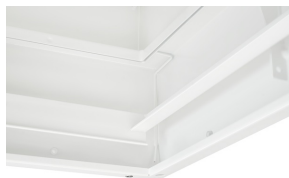
Test groove, detail