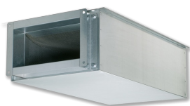
SECONDARY SILENCER TYPE TS