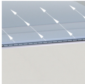
ANGLED ONE-WAY AIR DISCHARGE