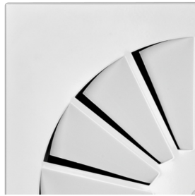
WITHOUT DISCHARGE NOZZLE