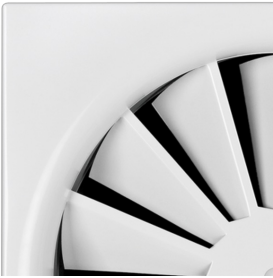
WITH DISCHARGE NOZZLE