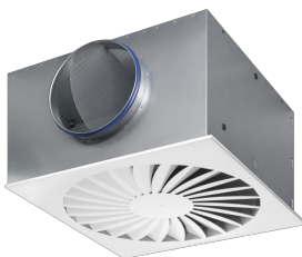
Square diffuser face with square plenum box