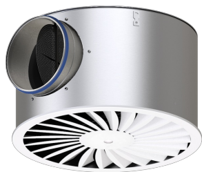
Circular diffuser faces with circular plenum box