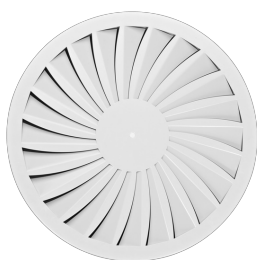
Round diffuser face