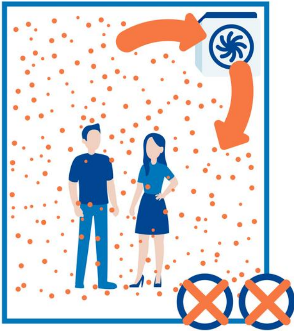
„Room air conditioner“ without filtration

Air conditioning systems without fresh air, without filters, or with only inadequate filters, do not reduce the virus load in a room.