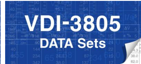
VDI 3805 COMPLIANT DATA